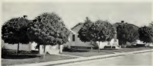
Street Planted to "C & O" Globe Locust